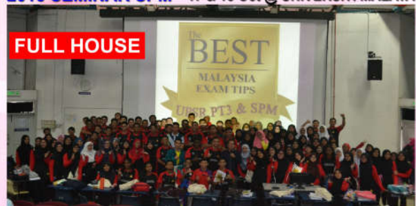
2015 SEMINAR SPM - 17 & 18 Oct @ UNIVERSITI MALAYA

Specially for those who want to SCORE A+