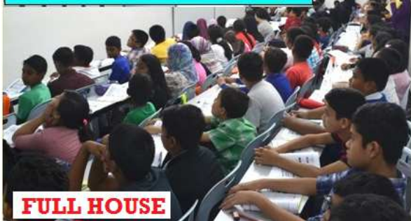
SEMINAR UPSR (SK)